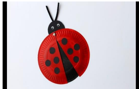
Paper plate ladybird

(Can you paint the spots so that you have different doubles?)