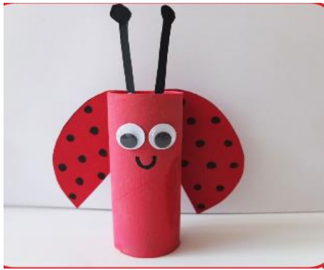
Toilet roll ladybird (see sheet)