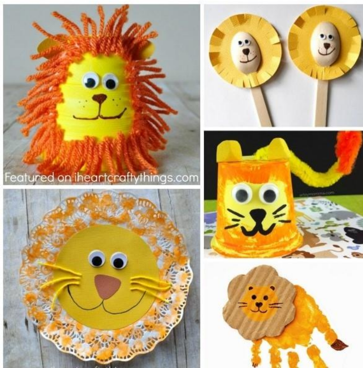
Lion craft activities