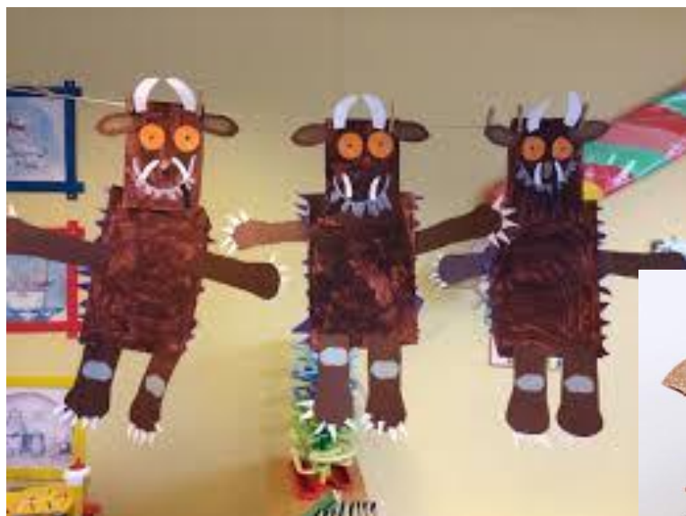
Make a Gruffalo collage!