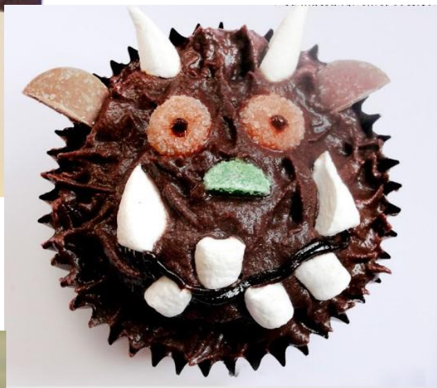
Make delicious Gruffalo cupcakes!